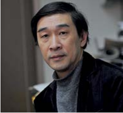
顾铮 GU ZHENG