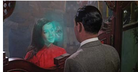
刘卫,《I’m just Wan Chai girl》,2018年。 Lau Wai, I’m just Wan Chai girl , 2018.

刘卫:明日记忆 Lau Wai: The Memories of Tomorrow