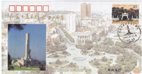
胡伟,来自《为公共集会(邂逅)的提案》系列,档案图片,2018年至今。 Hu Wei, from the series Proposal for Public Assembly/Encounter , archival image, 2018–ongoing.

胡伟:为公共集会(邂逅)的提案 Hu Wei: Proposal for Public Assembly/Encounter