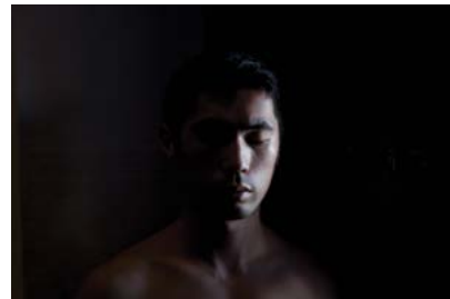
沈玮,《自拍像(库斯科)》,2013年。作品由沈玮和Flowers画廊(伦敦/纽约)提供。 Shen Wei, Self-portrait (Cusco) , 2013. Courtesy of the artist and Flowers Gallery (London/New York)