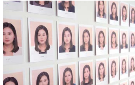
黄永生,《近况》,无酸纸艺术微喷,尺寸可变,2017年。 Wong Wingsang, Those Days , Acid-free giclee print, dimension variable, 2017.

黄永生:刺眼的黑色 Wong Wingsang: The Dazzling Black