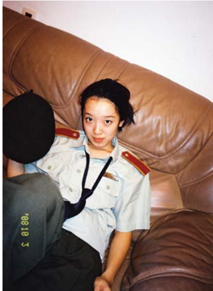
戴建勇,《20081003》,选自《朱凤娟2008–2015》系列,2008年。Coca Dai, 20081003 , from the series, Judy Zhu 2008–2015 , 2008.

戴建勇:朱凤娟2008–2015 Coca Dai: Judy Zhu 2008–2015