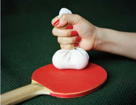
廖逸君,《乒乓球》,选自《实验性关系》系列,2013年。 Pixy Liao, Ping Pong Balls , from the series, Experimental Relationship , 2013.

廖逸君:实验性关系 Pixy Liao: Experimental Relations