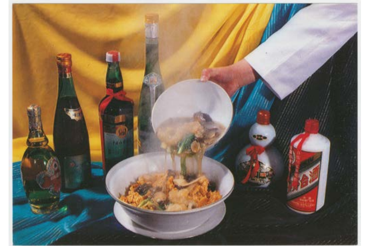
信封中的散装卡片,八十年代。 Recipes from the Great Hall of the People , set of loose cards in envelope, 1980s.

10 Jimei x Arles Discovery Award nominees: Ten talents of Chinese photography selected by five curators. The winner of the Jimei x Arles Discovery Award is awarded a 200, 000 RMB prize and an exhibition in the following year's edition of Rencontres d'Arles. The 2018 nominees are: Coca Dai (1976), Hu Wei (1989), Lei Lei (1985), Pixy Liao (1979), Lau Wai (1982), Shao Ruilu (1993), Shen Wei (1977), Su Jiehao (1988), Wong Wingsang (1990), Yang Wenbin (1996). They were selected by curators Dong Bingfeng, Li Jie, Chelsea Qianxi Liu, Holly Roussell and Wang Yan. Winners of the past editions include Feng Li (2017), Liu Silin (2016) and Zhu Lanqing (2015).